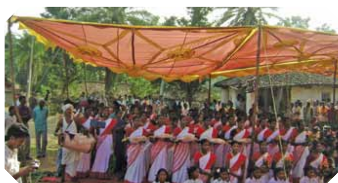
The Times of India, Ranchi, 25th Nov. 2010 UN volunteer's pat for Gumla women