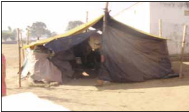
This is what is available as "HOUSE" for some of the DRI beneficiaries

On discussion with the lead bank regarding the schemes that can promote livelihood opportunities for the urban poor, we came to know about the DRI scheme (Differential rate of interest). This is a scheme available at all the nationalized banks which commits the banks to provide 1% of their outstanding advance amount of previous year to the poorest of the poor people of the community (often not known to most of the people). The scheme allows a maximum of Rs.20000/- loan to individuals below poverty line @ 4% differential rate of interest, i.e. Rs 4/- per Rs. 100/- in a year, and the interest is charged on the remaining principle amount to be returned. The time allowed to repay the loan is for five years.