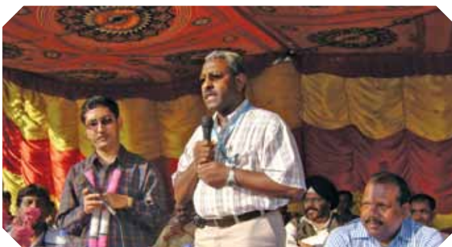
The Hindustan Times, Ranchi 22nd Nov. 2010 UN officer visits Gumla villages